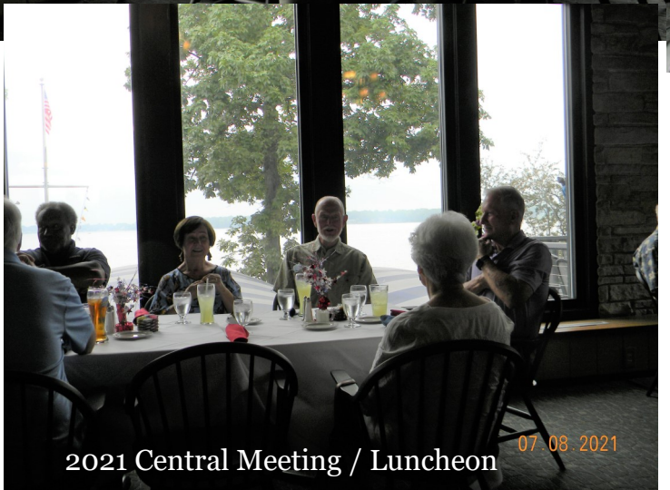
2021 Central Meeting / Luncheon 07.08.2021